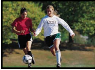
Table C-4 Soccer Fields Medford Planning Area

Table C-4 presents the inventory of soccer fields in the Medford Planning Area: