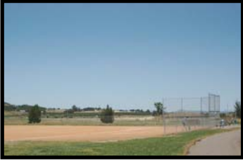
Table C-2 Adult Softball Fields Medford Planning Area

Table C-2 presents the inventory of adult softball fields in the Medford Planning Area: