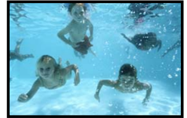
Table C-7 Swimming Pools Medford Planning Area

Table C-7 presents the inventory of indoor swimming pools in the Medford Planning Area: