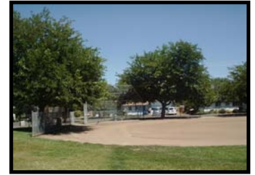
Table C-3 Youth Baseball/Softball Fields Medford Planning Area

Table C-3 presents the inventory of youth baseball/softball fields in the Medford Planning Area: